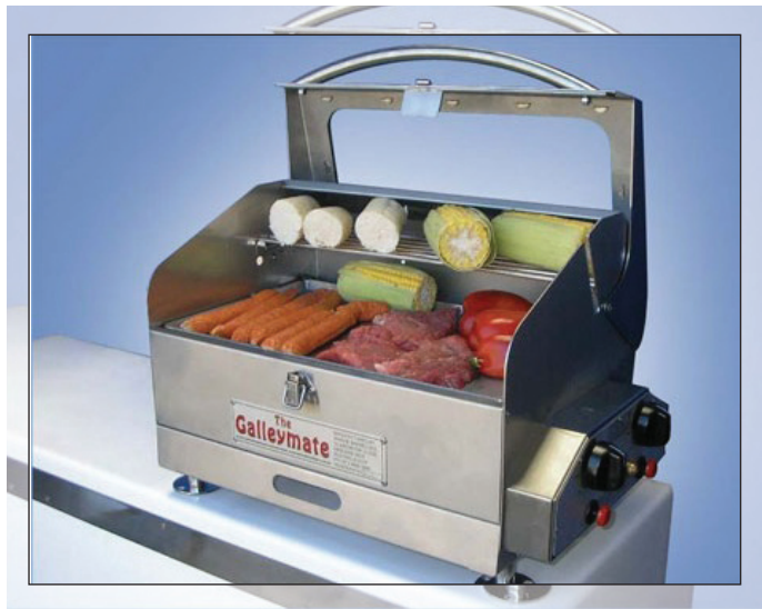
Even the smallest barbecue, the Galleymate 1100, is full-featured and can cook for up to six.

Want to bake a cake or a loaf of bread without heating up the galley on a hot summer afternoon? No problem. There is enough clearance between the rack and the cover in most Galleymate models to allow the barbecue to double as an oven. Placing the food on the back of the cooking surface and igniting only the front burner will avoid subjecting a baked item to direct heat.