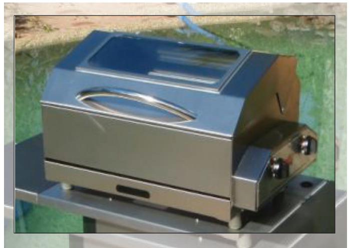
The Galleymate 2000 will cook for up to 10 people.